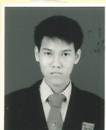
SMK PARAMITHA I KDP.PKL .012 P2/13