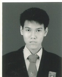
SMK PARAMITHA I

Jakarta, March 1st, 2013 Kolese Dharma Paramitha